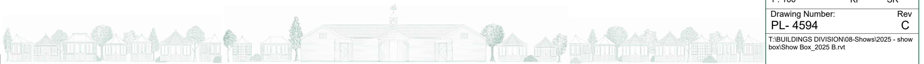
1 Proposed Layout PL- 4594 1 : 100

T:\BUILDINGS DIVISION\08-Shows\2025 - show box\Show Box_2025 B.rvt